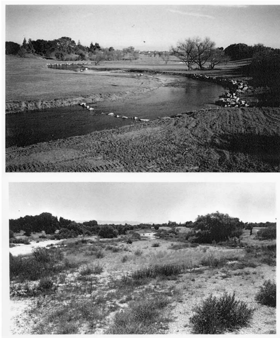
Figure 2. Photographs looking downstream along the channel of Uvas Creek in coastal California. (a) In January 1996, approximately 2 months after construction of a channel reconstruction project that emplaced a meandering channel form, and (b) in June 1997, after the project was destroyed during storm flows with a return period of 5–6 years. Historical geomorphological analysis indicated that the channel reach had been braided historically, typical of streams draining the Franciscan Formation in the California Coast Ranges, with episodic flows and high sand and gravel transport. (After Kondolf et al. [2001, Figure 5] with kind permission of Springer Science and Business Media.)

nels and floodplains [ Junk et al. , 1989; Bayley , 1991; Molles et al. , 1998]; patterns of downstream continuity or discontinuity in physical and biological parameters [ Vannote et al. , 1980; Fischer et al. , 1998; Poole , 2002; Benda et al. , 2004]; and vertical connections between the channel and underlying hyporheic zone [ Ward , 1989; Stanford and Ward , 1993].