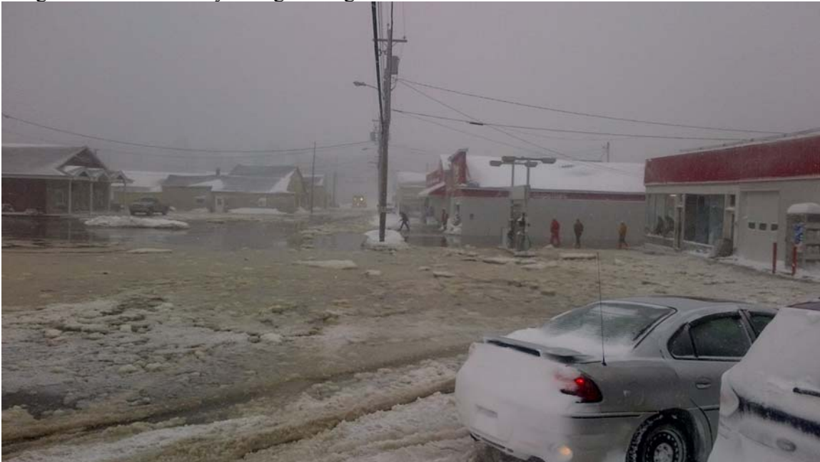
Late in 2013, Clare experienced a winter storm in which storm surge caused flooding and coastal erosion just where newly completed inundation maps had predicted it would occur.

Clare’s Municipal Climate Change Adaptation Plan (MCCAP), prepared largely by a planning firm in Halifax supported with gas tax funds, includes maps depicting areas that would be most vulnerable to sea-level rise, storm surge and erosion. The long shoreline of Clare is considered at moderate-to-high risk due to a combination of winds, currents and tides along its coast and the geologic substrate there. Within months of submitting its MCCAP, the community experienced a winter storm that demonstrated just what the modeling had predicted—storm surge flooding in low-lying areas and evident erosion. “Sometimes the planning work can feel theoretical, but we know now it can happen,” says Clare’s Administrative Assistant to the CAO Colette Deveau King. “That storm really brought things home.”